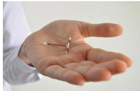
Intrauterine device (IUD): about the size of a quarter