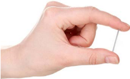
Contraceptive implant: about the size of a match stick